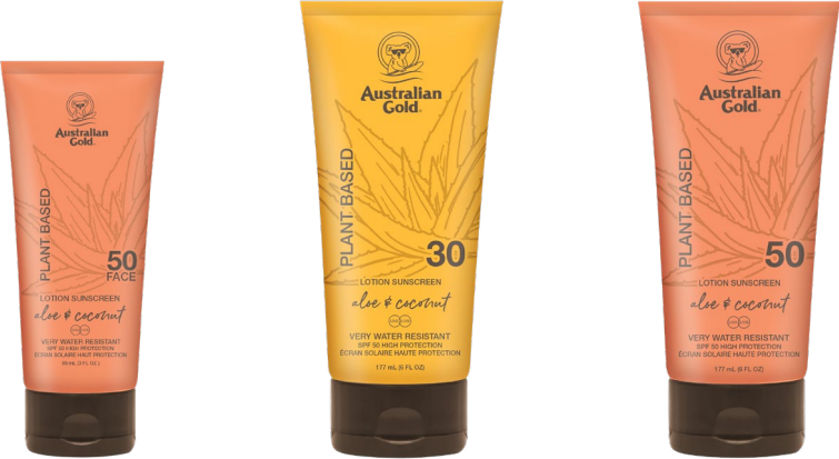
Plant Based SPF 50 Face Lotion 88mL Plant Based SPF 30 Lotion 177mL Plant Based SPF 50 Lotion 177mL

The Australian Gold Plant Based Line uses the natural and effective power of plants to provide excellent skincare for your face and body while protecting the skin from UVA and UVB rays. Formulated with high concentrations of Aloe Vera and Coconut Oil, these lotions are for those looking for a plant derived sunscreen option.