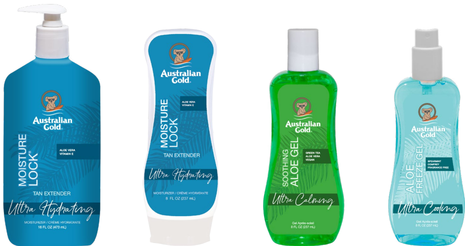
Moisture Lock Tan Extender 473 mL Moisture Lock Tan Extender 237 mL Soothing Aloe Gel 237 mL Aloe Freeze Spray Gel 237 mL

Soothe, nourish and moisturize your skin with Australian Gold After Sun Care products.