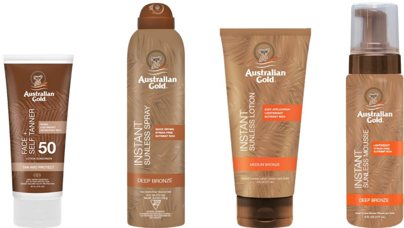
SPF 50 Face with Self Tanner 88 mL Instant Sunless Spray 177 mL Instant Sunless Lotion 177 mL Instant Sunless Mousse 177 mL

Achieve instant, natural looking color with the Australian Gold Instant Sunless Collection. This collection blends bronzers with skin softeners to nourish and condition for a longer lasting, streak free, bronzed hue.